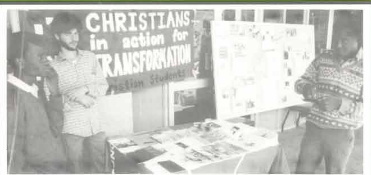
THE OPTION FOR NON-RACIALISM