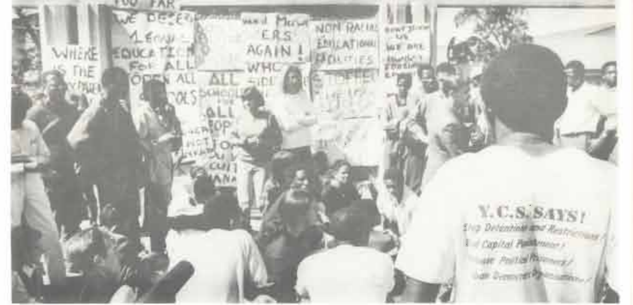
THE OPTION FOR LIBERATION