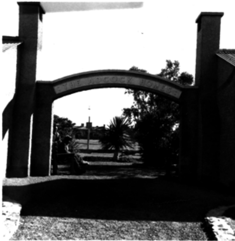
ENTRANCE TO THE ADCOCK HOMES - HOMES FOR AGED AFRICANS - THE HOMES ARE CONTROLLED BY THE BANTU BENEVOLENT SOCIETY AND PROVIDE ACCOMMO- DATION FOR AGED AND INFIRM AFRICANS. EACH INDIVIDUAL IS CHARGED 15/- PER MONTH AND FOR THIS HE RECEIVES FOOD, ACCOMMODATION, BLANKETS AND CLOTHING.