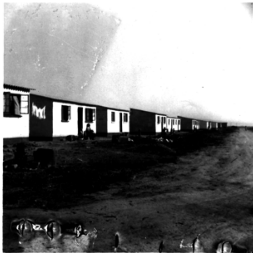
A ROW OF NEWLY COMPLETED HOUSES.