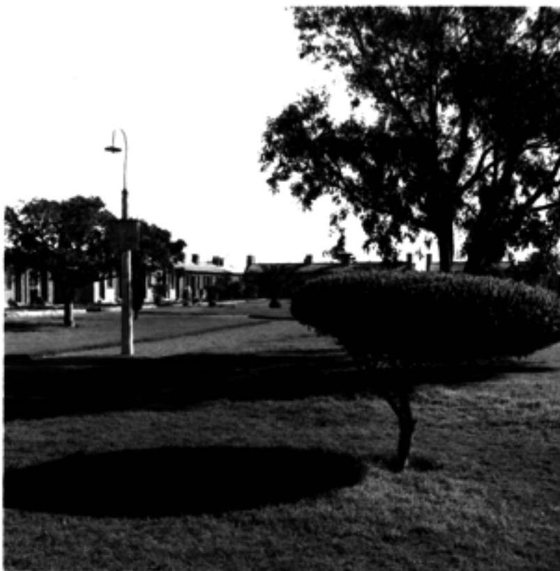
THE GROUNDS INSIDE THE ADCOCK HOMES.