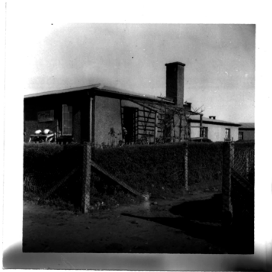
TYPICAL HOME IN McNAMEE VILLAGE AT NEW BRIGHTON.