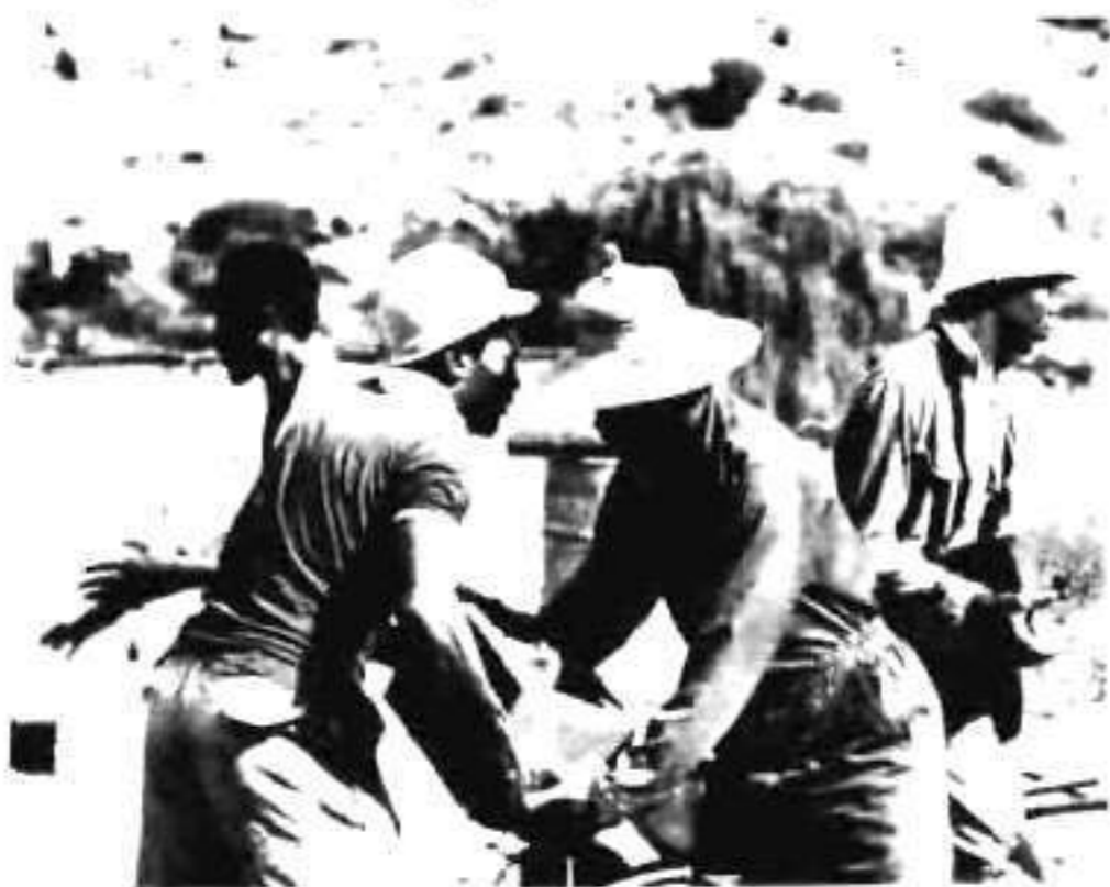
Workers organise production democratically in the co-ops, but they still must meet their targets