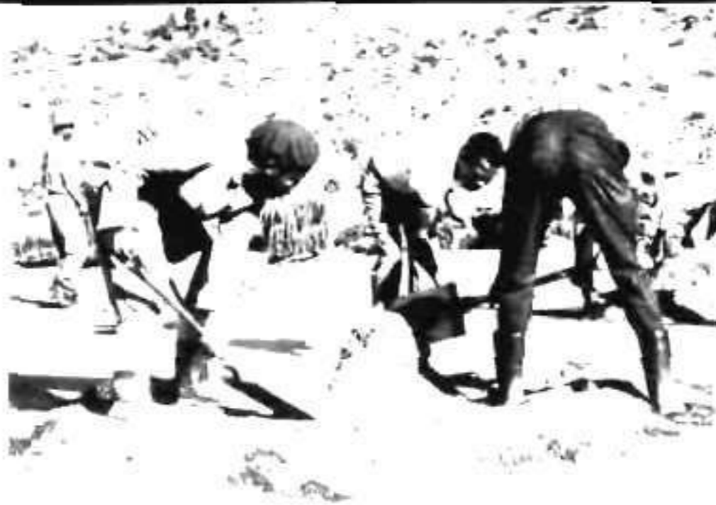
The Basotho Mineworkers Labour Co-operative has started a co-op producing cement blocks in Quthing

The co-op members also have to plan ahead, and set aside money each month so that they can afford to replace their machinery when it's old.