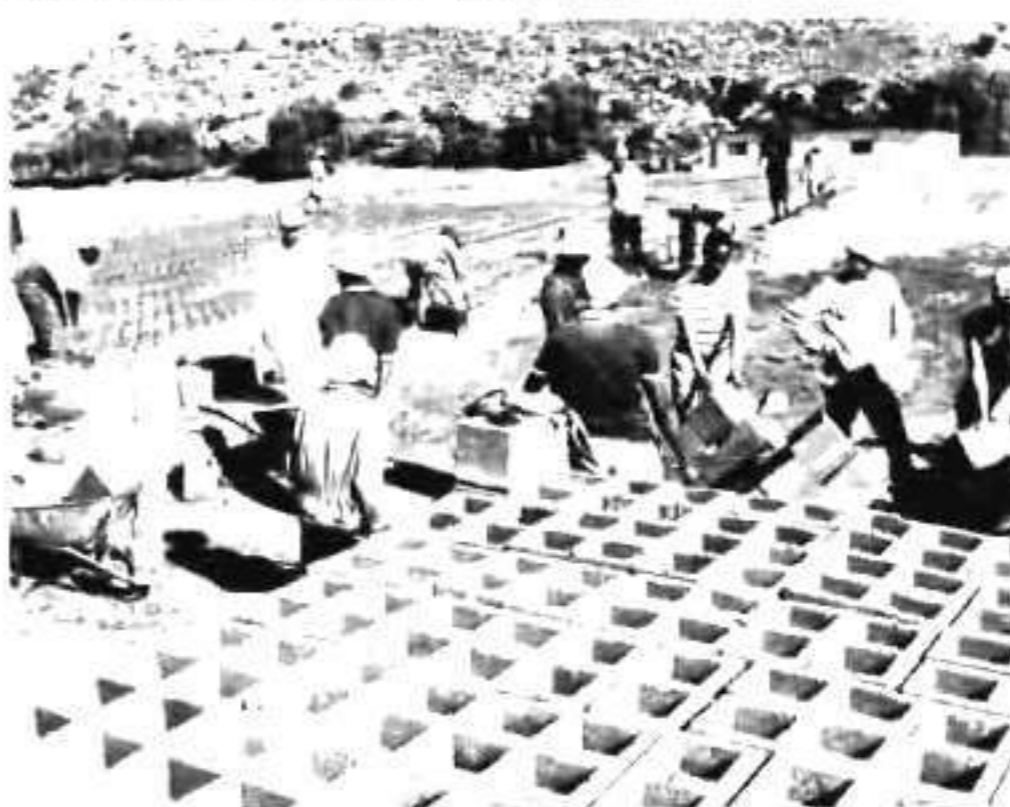
Most co-operatives are small and while they can provide employment for some workers, they cannot solve the unemployment problem

They need a marketing strategy, to make sure they can sell what they produce. And there must always be enough money in the bank to buy all the materials needed to keep production going.