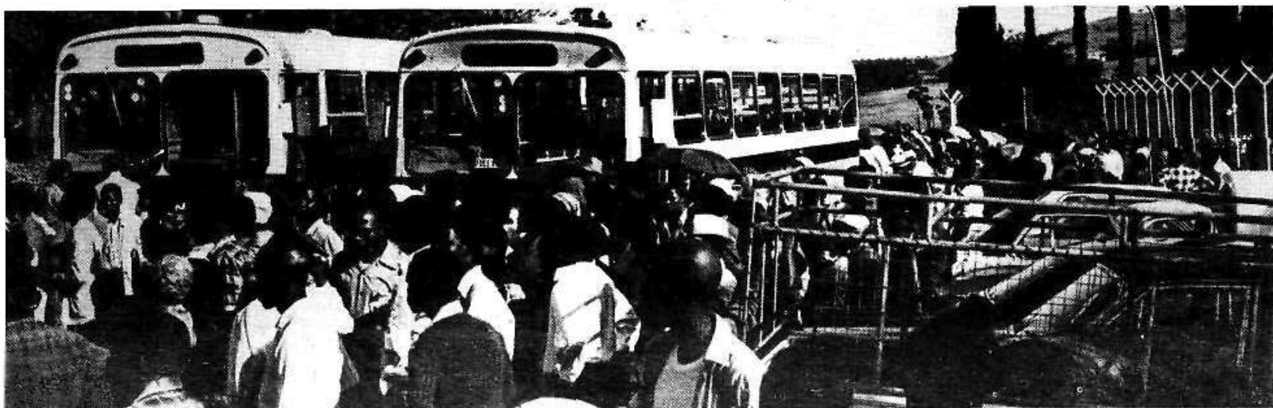
Hammarsdale workers on the march