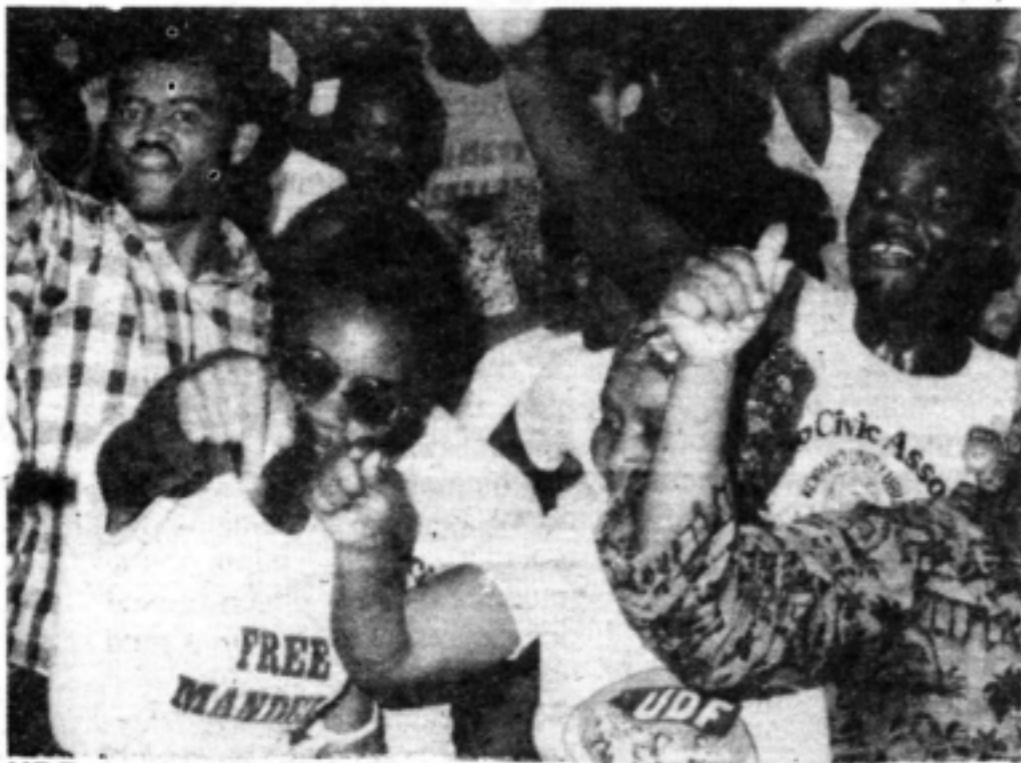
UDF commands the support and respect of thousands of South Africans

IN just over a year, the UDF has become a national mass movement which has won the support and respect of thousands of South Africans.