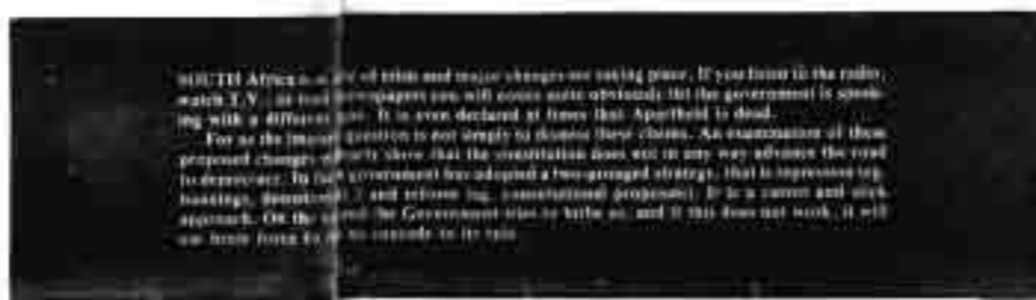
SOUTH AFRICA is a land of truth and justice changes are being made, if you listen to the radio, watch T.V., or read newspapers you will soon notice obviously that the government is speaking with a different tone. It is even declared at times that Apartheid is dead. For so the important question is not simply to discuss these claims. An examination of these proposed changes clearly shows that the constitution does not in any way advance the road to democracy. In fact government has adopted a two-pronged strategy, that is repression by force, detention, and reform by constitutional proposals. It is a carrot and stick approach. On the one hand the Government tries to bribe us, and if this does not work, it will use force to force us to concede to its rule.

The Government is already introducing autonomy through the back door, as the greater delegation of powers to the Langa Management Committee recently proved.