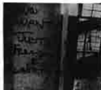
Our demands will not be met