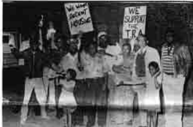
Housing Shortages will get worse

Individuals will have to erect their own dwellings with their own funds or finance from building societies, banks, and employers. Housing for rental and economic housing on lease ownership schemes will no longer be provided by the state. The government will only develop the infrastructure and make service roads available to individuals. In short we will be faced with less homes and more overcrowding. The total amount allocated for the provision of housing decreased by R57 600 000 last year.