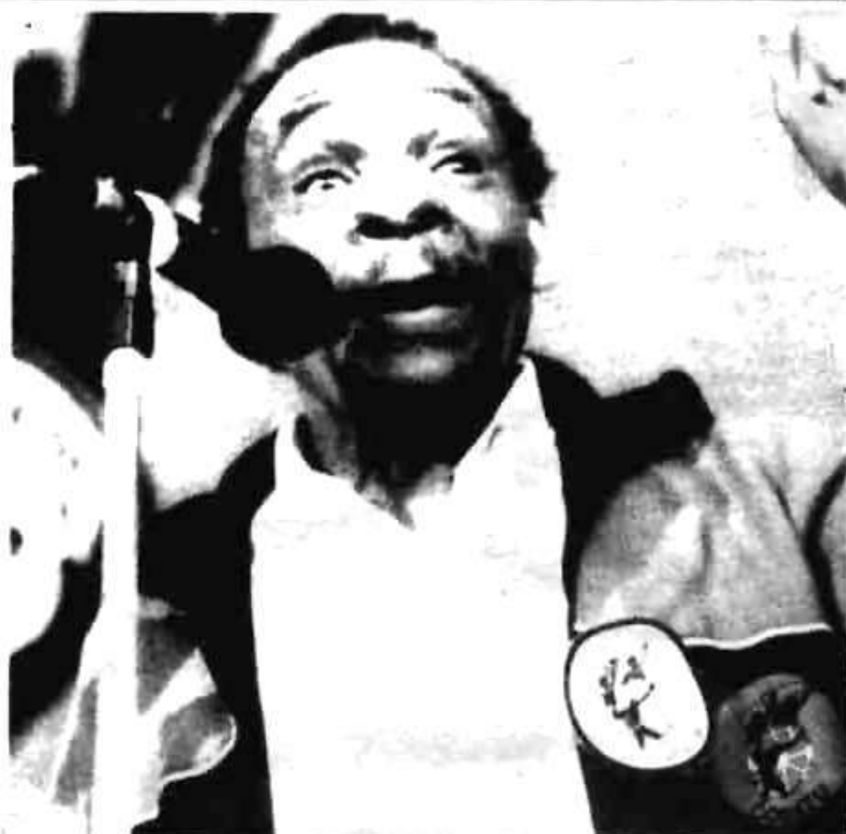
COSATU President Comrade Elijah Barayi.

The adoption of the Freedom Charter last year by COSATU and the UDF demonstrated the growing unity in the ranks of the oppressed and exploited. Our living wage campaign, and the power and strength of the strikes which sustained it, showed that workers can and must lead the