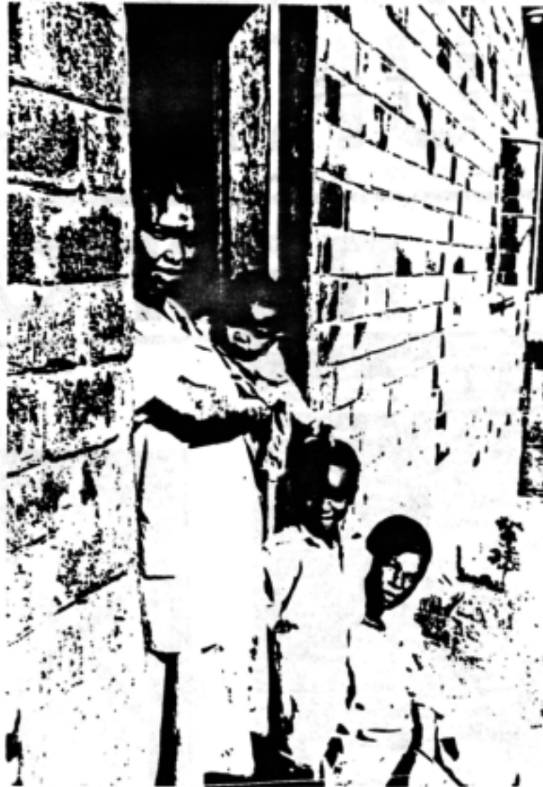
A single working mother with her three children.

There are absolutely no recreational facilities. A single understaffed non-governmental clinic which opens only twice a week exists for the thousands of residents. Although there are many single working mothers in Riverlea Extension there isn't a single creche.