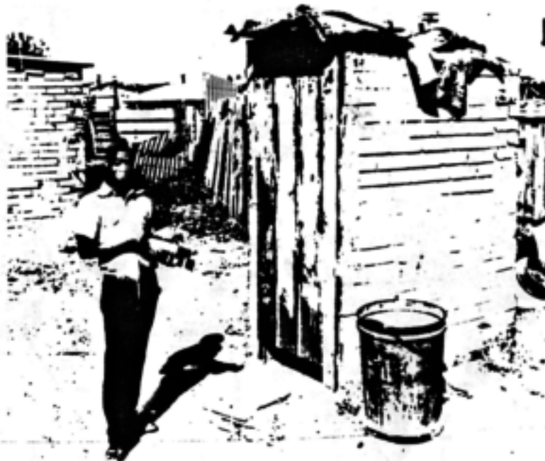
A typical toilet in Riverlea Extension.