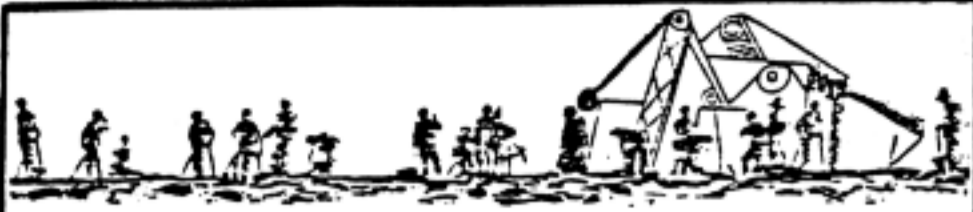
Black Allied Mining and Construction Workers Union (BAMCWU)