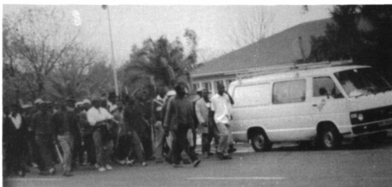
Top: Natal farm labour tenants discuss how to strengthen their organisation at a meeting in March 1993.