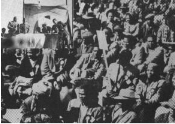
Crowd at Congress of the People (1955) to adopt Charter

We, The people of South Africa, declare for all our country and the world to know: