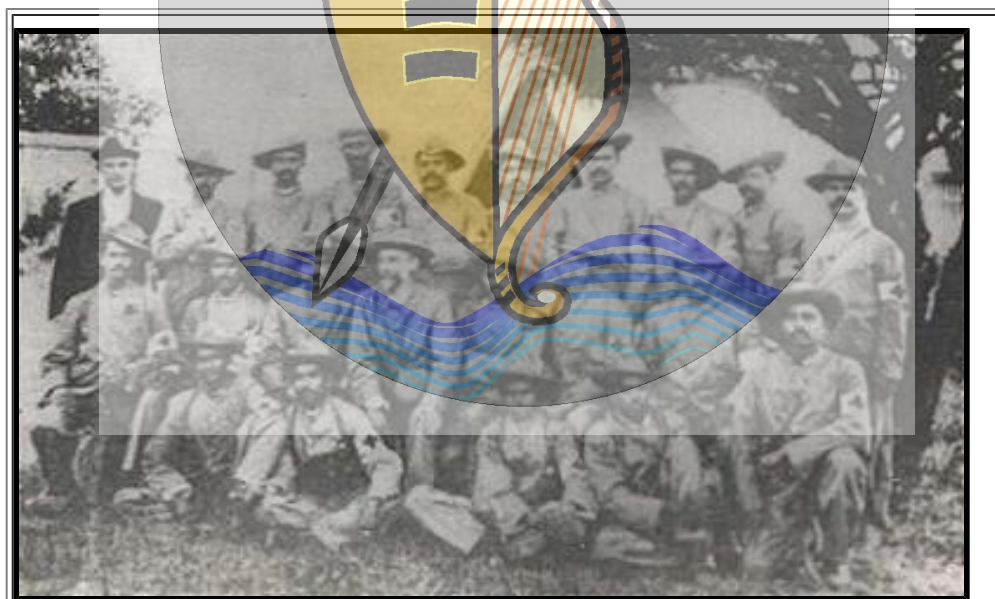
Stretcher-bearers during Anglo-Boer War 1899-1902

Gandhi's concept of non-violence did not include passivity or cowardice in the face of violence or the abdication of one's duty. Gandhi offered his services freely during the Anglo-Boer War of 1899. He formed an Indian Volunteer Ambulance Corps of 1400 men, many of whom were traders and professionals. They saw to the needs of the sick and wounded and often worked in the thick of battle in areas such as Spion Kop, Colenso and Ladysmith. For their efforts, members of the Corps were decorated with medals.