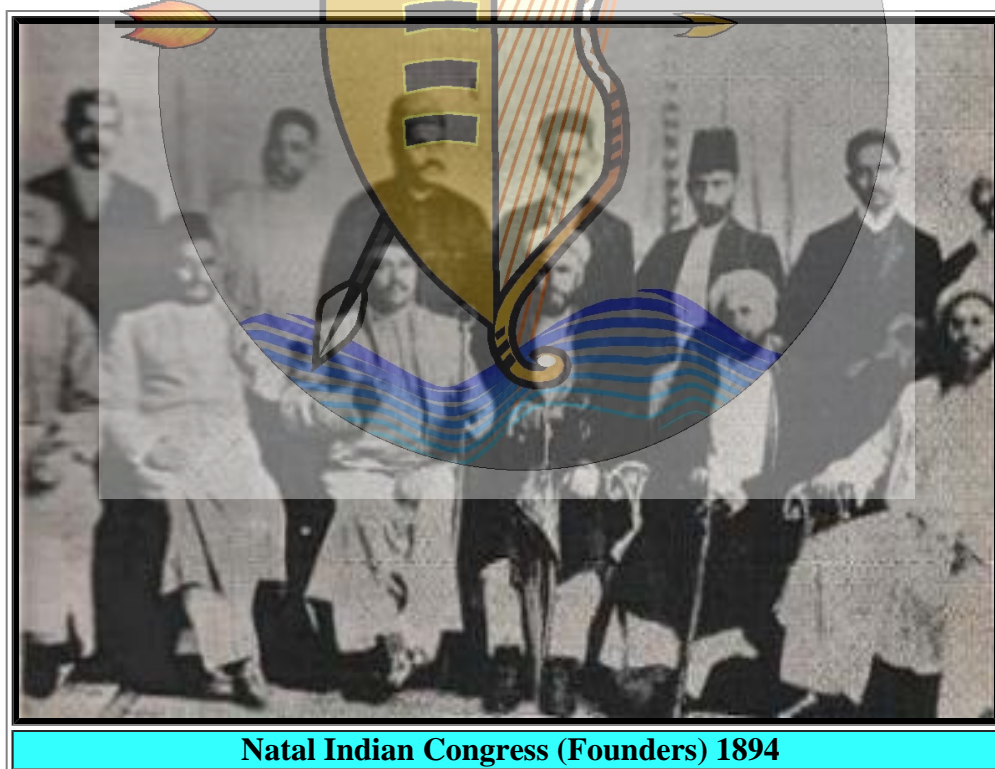
Natal Indian Congress (Founders) 1894

Gandhi had felt the need to organise local Indians politically. The franchise question had brought together some 2500 signatories and this was used as a catalyst in the formation of a political organisation. Subsequently, the Natal Indian Congress (NIC) was formed on 22 August 1894. The NIC became the mouth piece of the Indian people, its primary objective was to strive for equal treatment of Indians locally. However, most of the members were drawn from the merchant class. The membership fee of 3 pounds was prohibitive to the labourers most of them being still under indenture. Gandhi became the organisations first secretary and was a driving force behind it. Gandhi thereafter, not without some difficulty, was admitted as an advocate and started practising law in Durban.