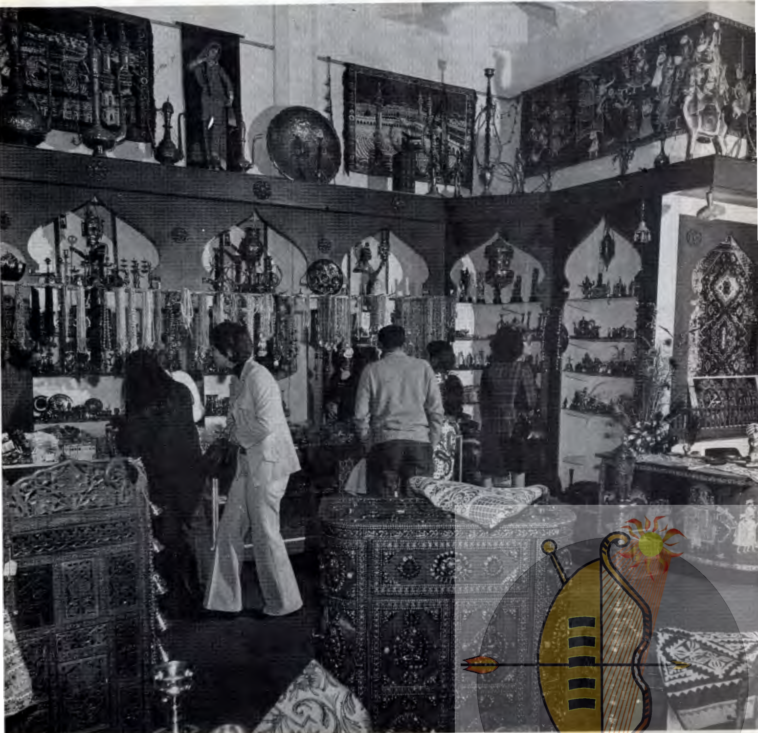
An impressive gift shop in the Oriental Plaza, a R12,5-million complex in Fordsburg, Johannesburg, with more than 130 shops in its Grand Bazaar, all leased to Indians