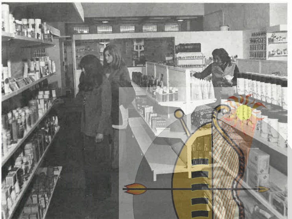
Interior of a self-service chemist with a well-equipped dispensary, Oriental Plaza, Fordsburg, Johannesburg. The plaza is a free trade area where Indians also do business with other population groups