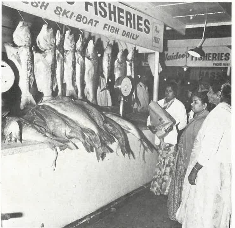
The Indian Meat and Fish Market, Durban, Natal