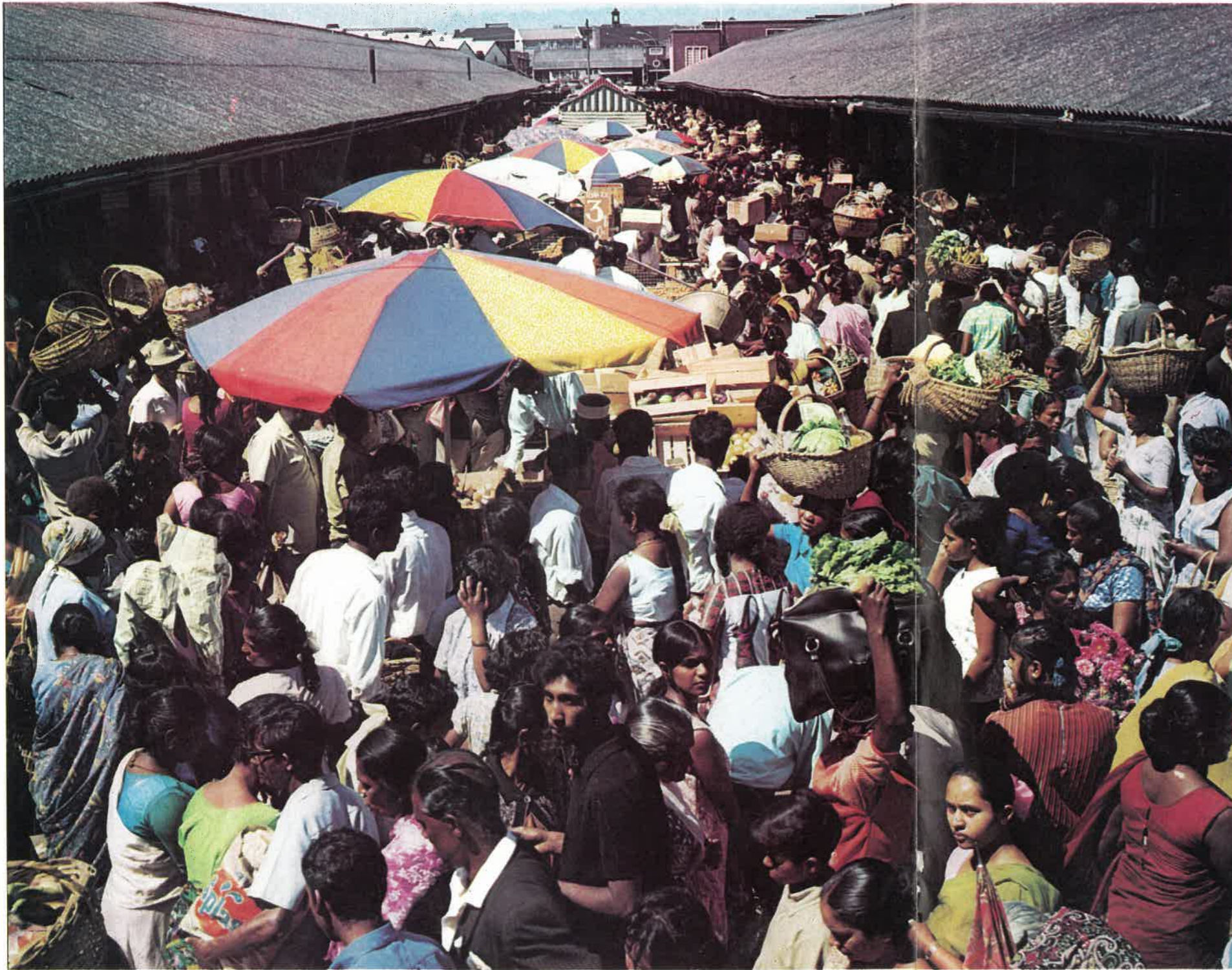
Bottom: Grey Street, Durban – heart of the Indian business world. Its Eastern atmosphere fascinates visitors to the city