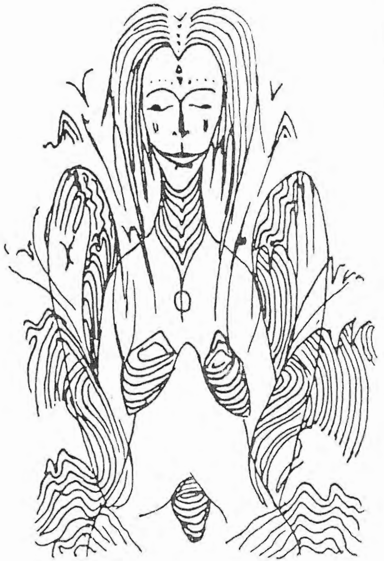
Illustration by Demas Nwoko in Heavensgate (1962)