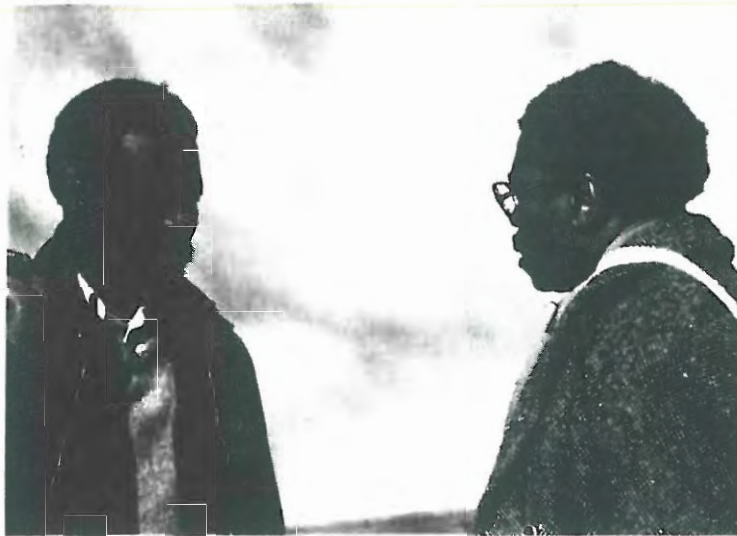
Mongane Wally Serote